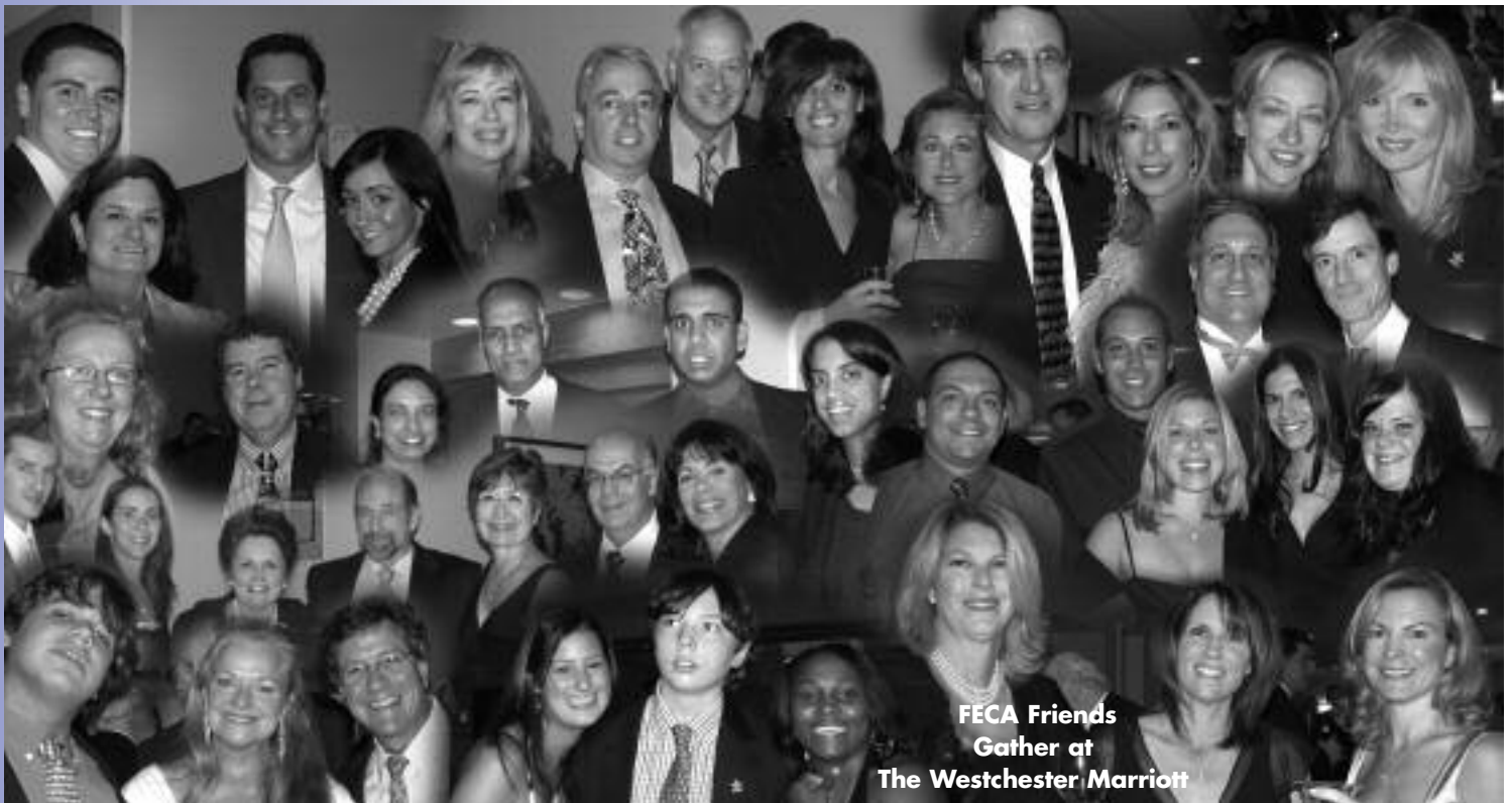
FECA Friends Gather at The Westchester Marriott